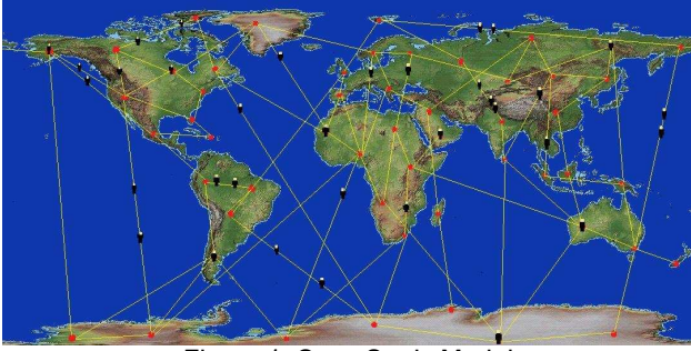
Figure 1. Case Study Model

the course of achieving their goals. A concrete example of this model is a social simulation application where the environment represents the world, and agents represent "humans" (see Figure 1). In this case, nodes correspond to physical locations, and edges are pathways between nodes. We assume that the environment is dynamic in the sense that during a simulation, changes can be made to the graph. The purpose of the simulation is to study the reaction of agents to environmental factors.